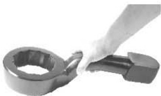
Offset Slugging Wrench