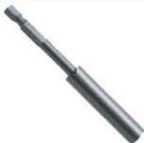
Slotted Power Bit (Minus Bit) with Bit Finder