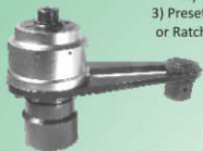
Hand Torque Multiplier