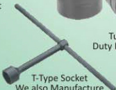
T-Type Socket We also Manufacture T-Handle