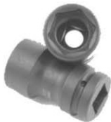
Combination Budd Wheel Socket (Special)