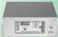
Digital Torque Controller