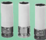
Rubber Coated Anti Mar Sockets