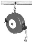
Air Hose Reel