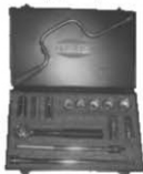
Socket Sets (Available in 3/8", 1/2", 3/4" as per customer specification)