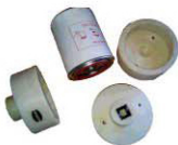
Oil Filter Socket Available in 3/8" & 1/2" Drive (Nylon Material)