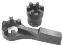
Castellated 6 Pronged Socket & Castellated 6 Pronged Slugging Wrenches (GE Design)