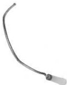
Magnetic Retriever (Pick Up Tool)