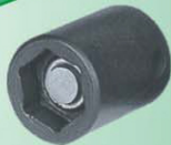
Fixed Center Magnetic Socket (Side Magnet & Spring Loaded Magnetic Deep Types also available)