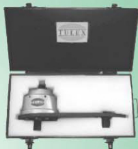
Multiplier Packed in a Metal Box