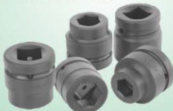
Tulex Heavy Duty Impact Sockets