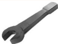
Open Jaw Slugging Wrench