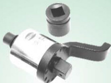
Slim Type Hand Torque Multiplier