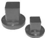
Top Hat Adaptor (Magnetic) (Special)